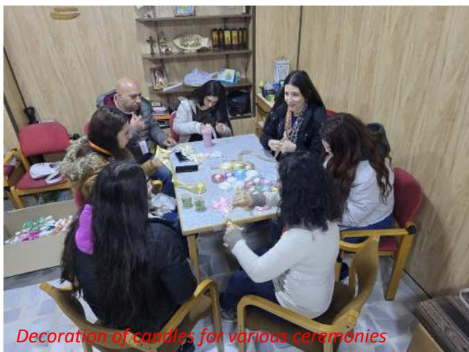
Decoration of candles for various ceremonies

We see numerous opportunities here to gradually create meaningful, sustainable work. There are many talented, competent, and very hardworking people who can achieve a great deal if they are given some form of start-up support.