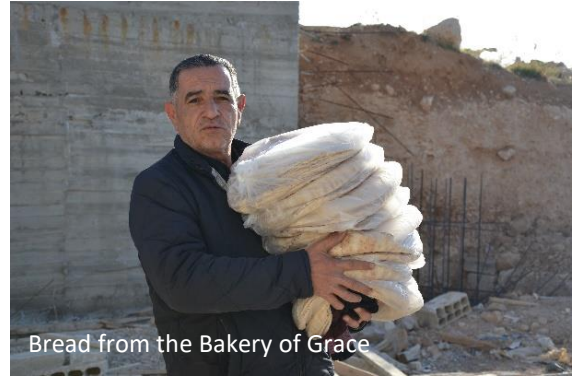
Bread from the Bakery of Grace

I should like to add a few words about the Bakery of Grace: The dollar has meanwhile risen above the 4,000 mark, i.e. at today's exchange rate 1 $ = 4,100 SYP. We still sell the bread for 100 SYP/kilo = 0.02 €. Of course the production cost is higher now. Even so, we haven't stopped producing bread to feed the poor. The Covid pandemic has additionally exacerbated the situation.