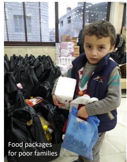
Food packages for poor families

We are currently organizing emergency food packages. Every month we are distributing packages to between 500 and 1,000 families, thanks to the support of some aid organizations such as ICO, Diocese Stockholm, Archdiocese of Cologne, Cathedral Chapter of the Metropolitan Church of St. Stephen's in Vienna. Of course, the need is much greater. I am