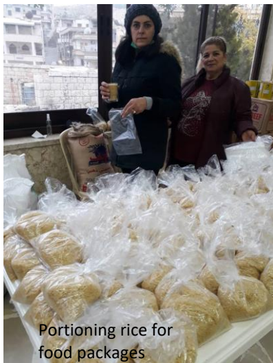
Portioning rice for food packages

Soon we will add to the building a social market and a soup kitchen to provide the people with basic food.